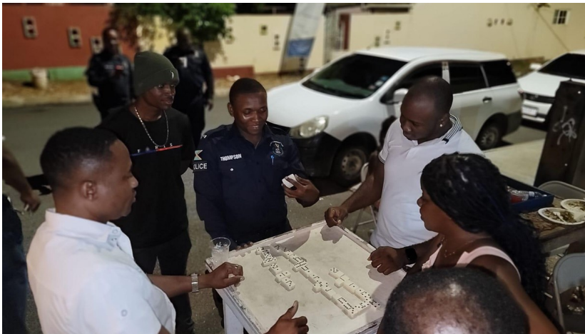
Competitive spirit & camaraderie was high at the Lyme and Dine on September 30 at the Hellshire Police Post